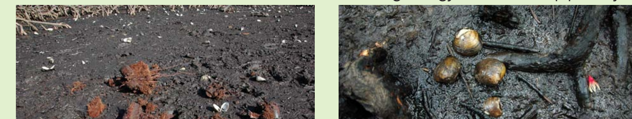
Unusual combination: Clams / cockles and flowers of Bruguiera gymnorhiza on top peat layer

In lieu of this, this recent finding of mangrove peat in Koh Kong Province could shed new light in the development of peatlands in Cambodia.