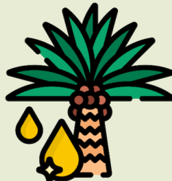
Oil Palm plantation